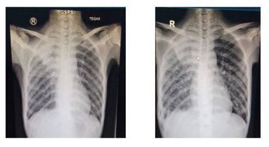
Figure 1. Chest Xray showed Non-Homogen Nodular Opacities.

resistance was not detected. Chest Xray revealed right pleural effusion, partially nodular inhomogeneous opacity in both lung fields and no radiological abnormalities were seen in heart (Figure 1). Chest CT scan was (Figure found 2). Ultrasound examination revealed chronic liver disease. After administration of antituberculosis drugs and titration of pyrazinamide and isoniazid there was an increase in the transaminase enzyme, namely SGOT:550 U/L SGPT: 252 U/L